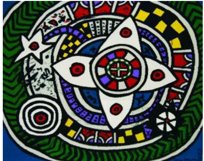
Alan Davie Cosmic Spiral (2003) Dovecot Studios